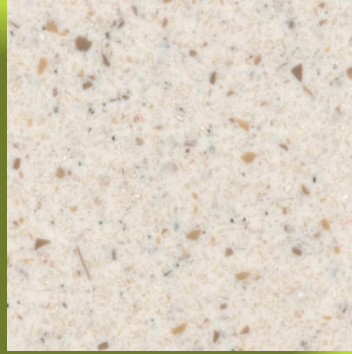
Honey Crunch F1-4330